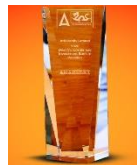
Best Corporate & Investment Bank: 2020